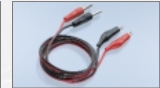
Universal charge lead Banana plugs / crocodile clips Cable: 0.75 mm 2 , 100 cm long No. 8259 Pack of 1