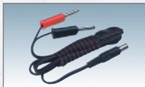
Transmitter charge lead Banana plugs / NES-J plug, 100 cm long No. F 1415 Pack of 1