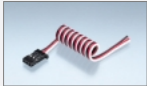
Servo lead, gold, 0.3 mm 2 Cable: 0.3 mm 2 , 30 cm long No. 4400 Pack of 1 No. 4401 Pack of 50