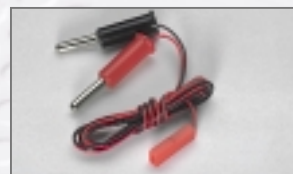
BEC charge lead Banana plugs / BEC plug Cable: 0.3 mm 2 , 100 cm long No. F 1418 Pack of 1