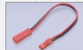
BEC extension lead Battery box - switch harness extension, 10 cm long No. 8038 Pack of 1