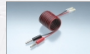
Lead/acid battery charge lead Banana plugs / 4.8 mm Faston plugs Cable: 0.75 mm 2 , 100 cm long No. 8137 Pack of 1