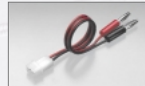
AMP charge lead Banana plugs / AMP Mate-N-Lok plug Cable 1 mm 2 , 30 cm long No. 8253 Pack of 1