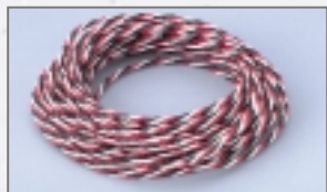
Servo cable, twisted, 0.14 mm 2 For installation in wings No. F 1452 400 m No. F 1452005 5 m