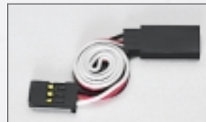
Servo extension lead, 100 cm Cable: 0.3 mm 2 , 100 cm gold No. 4387 Pack of 1