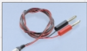
Direct charge lead, international Banana plugs / Molex plug Cable: 0.14 mm 2 , 100 cm long For batteries No. 4377 and 4414 No. 8263 Pack of 1