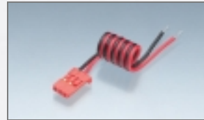
Battery lead, gold, 0.3 mm 2 Cable: 0.3 mm 2 , 20 cm long No. 4404 Pack of 1 No. 4405 Pack of 50