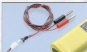
Direct charge lead, F-series Banana plugs / Molex plug Cable: 0.14 mm 2 , 100 cm long No. 8262 Pack of 1