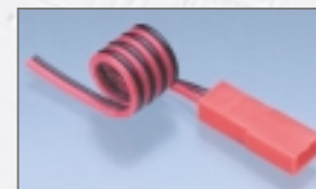
BEC socket lead Cable approx. 0.14 mm 2 , 15 cm long No. F 1409 Pack of 1 No. F 1409005 Pack of 5