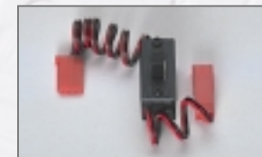
BEC switch harness 3-pin micro-plug and BEC socket, no charge socket No. F 1401 Pack of 1