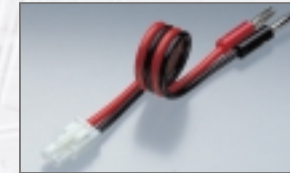
JST/TAM charge lead Banana plugs / JST-TAM plug Cable 1 mm 2 , 30 cm long No. 8192 Pack of 1