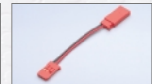
Power lead, 50 mm Connects receiver and battery directly, no switch harness requir- ed No. F 1411 Pack of 1