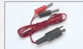
Transmitter battery charge lead Banana plugs / DIN plug Cable: 0.25 mm 2 , 100 cm long No. F 1417 Pack of 1