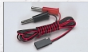
Receiver battery charge lead Banana plugs / 3-pin micro- connector Cable: 0.25 mm 2 , 100 cm long No. F 1416 Pack of 1