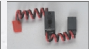
Standard switch harness 3-pin micro-plug and socket, no charge socket No. F 1408 Pack of 1