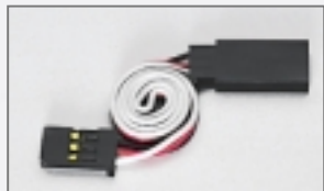
Servo extension lead, 20 cm Cable: 0.3 mm 2 , 20 cm gold No. 4385 Pack of 1