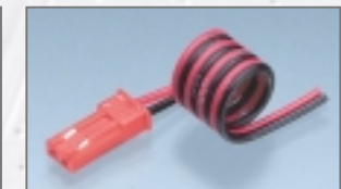
BEC plug lead Cable approx. 0.14 mm 2 , 15 cm long No. F 1410 Pack of 1 No. F 1410005 Pack of 5